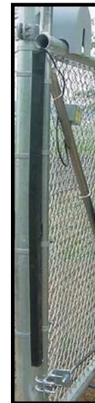
Miller Model ME-120 Safety Edges