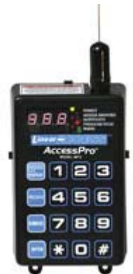
AP-5 Mega Code Receiver