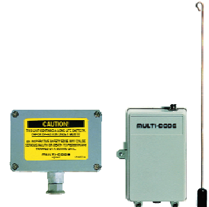
Multi-Code Receiver & Transmitter