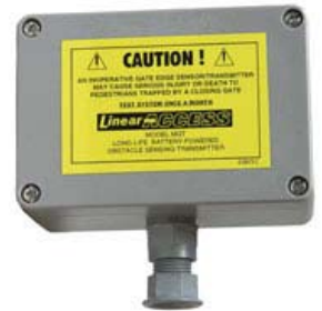
MGT Mega Code Transmitter