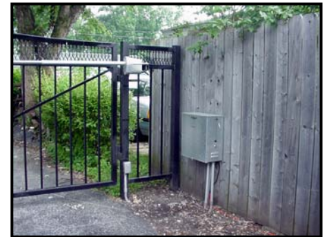
Color is BLACK (Shown in silver for clarity)