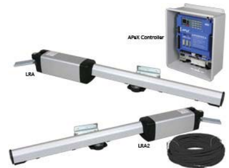
Double Gate Kit Shown