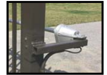
Bolt on arm