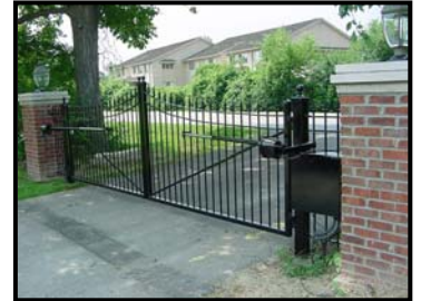
Shown with control box