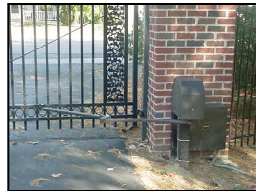
Shown with control box