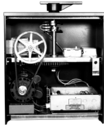
Width: 22" • Height: 24" • Depth: 13"